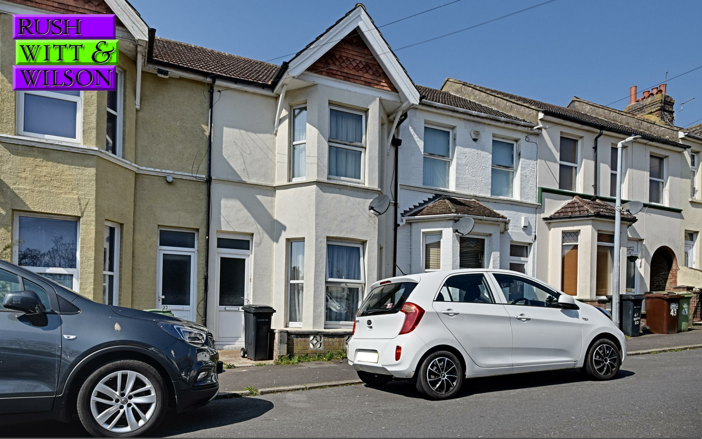
39 North Road, Bexhill-On-Sea, East Sussex TN39 5BJ £217,500